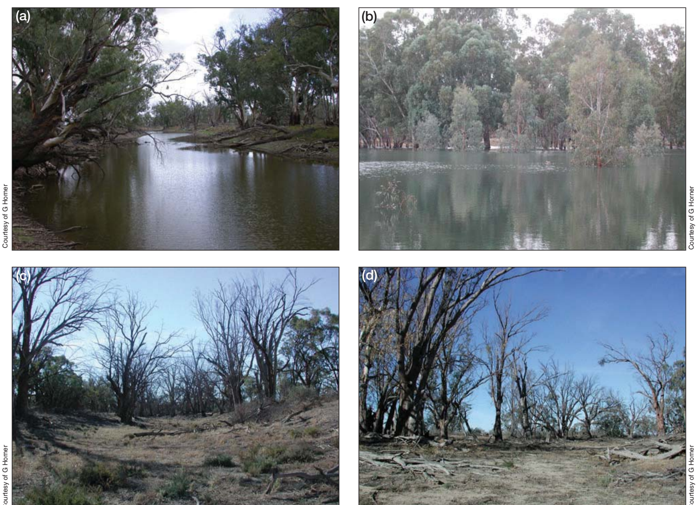
Figure 4. An example of proactive management, in which artificial floodplain inundation is maintaining river red gum (Eucalyptus camaldulensis) health on (a) Wallpolla and (b) Lindsay Islands on the Murray River floodplain in southeastern Australia. In neighboring areas of the Islands, (c and d) flow regulation and drought are causing widespread tree mortality. Reactive response will require widespread replanting and the forest will take decades to recover.

with increased discharge, projects involving additional stormwater control or modifications to dams or dam operation may be needed to protect ecosystems and people (Table 2). If these are not implemented proactively, rehabilitation projects to stabilize eroding riverbanks or reconfigure damaged river channels may be required and the costs may be high. In water-stressed areas, efforts involving wetland creation and floodplain reconnection may be needed to increase water retention and groundwater recharge (Figure 4). One could also imagine situations in which drier conditions lead to a need for stream banks to be stabilized or habitats improved (eg if the number of impoundments in the basin increased because of water shortages).