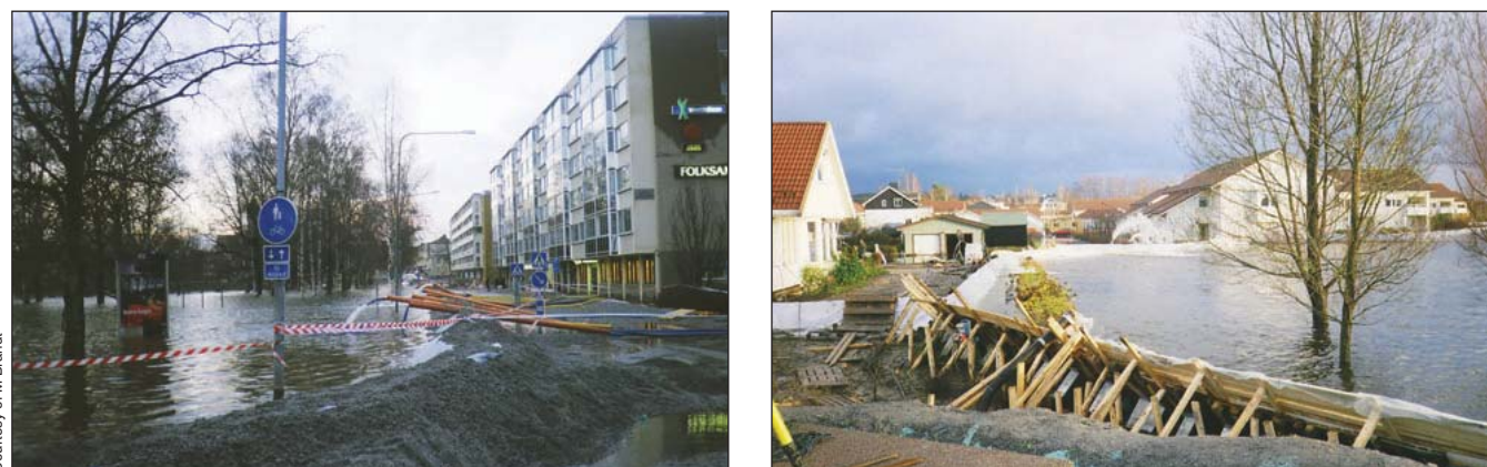
Figure 3. From November 2000 to January 2001, the town of Arvika and areas further downstream of the regulated Klar River valley in southern Sweden experienced a severe flood. The cost of repairing or compensating damage on buildings, infrastructure, agriculture, and fishing, and of the rescue work amounted to more than US$60 million.

Asia, the Ganges, Hai He, Liao, and parts of the Huang He and Amur in Asia, and the Australian Murray-Darling. Interestingly, a few basins that are expected to gain water under future climates will still remain severely water stressed (eg the Colorado, the Hindus, Hai).